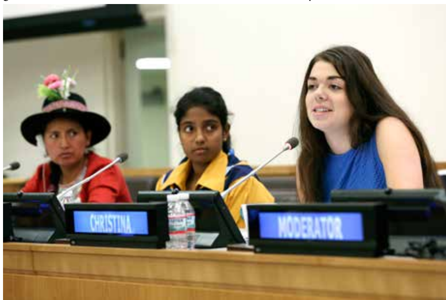
Panelists at a stakeholder’s forum on “Challenges and achievements in the implementation of the Millennium Development Goals for women and girls — The road ahead” on 5 December 2013.