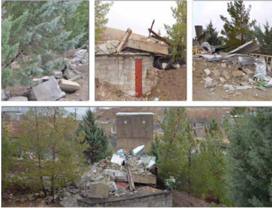
Unknown attackers destroyed portions of the Bahá'í cemetery in Sanandaj, Iran, sometime in the morning of 12 December 2013. As the photographs above indicate, the morgue, where bodies are washed, along with the prayer room, a water tank, and the walls of the cemetery were destroyed. Since 2005, there have been at least 42 attacks on Bahá'í cemeteries in Iran.