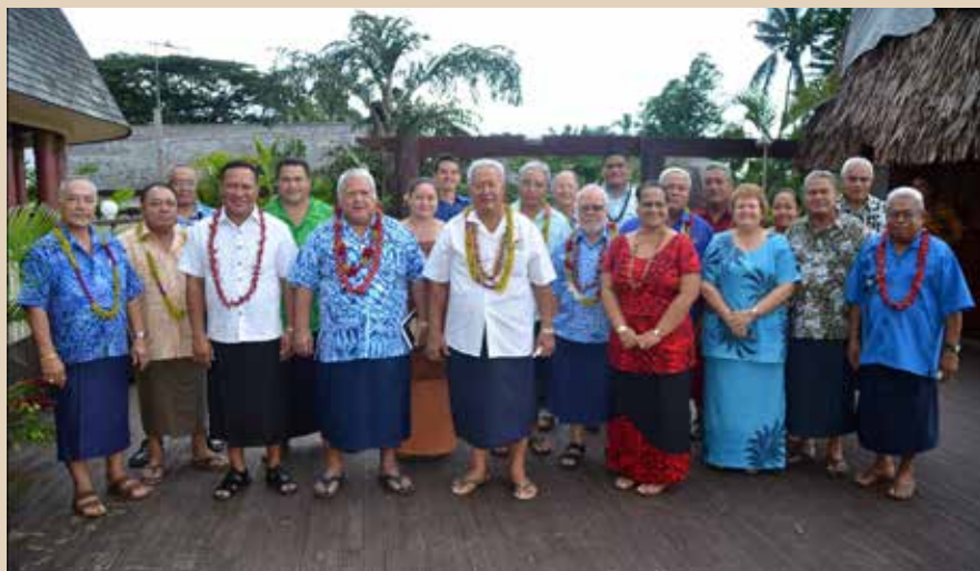
Prime Minister Tuilaepa Sailele Malielegaoi with cabinet ministers and members of the Bahá'í community of Samoa at the celebration of their 60th Anniversary.