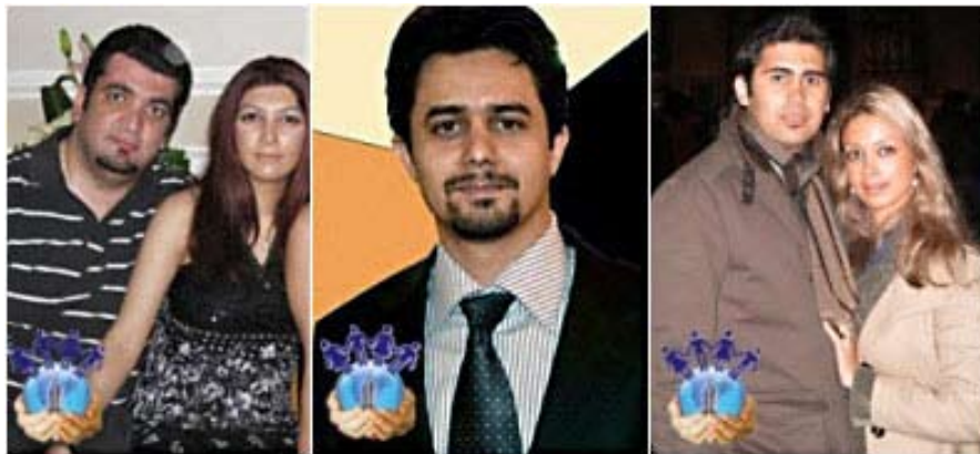
Above are photographs of some of the 10 Bahá'ís arrested on 3 January 2010, according to the Committee of Human Rights Reporters, which published the photographs on the Web.