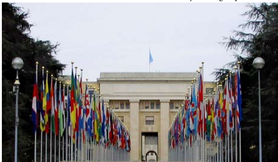
The UN Human Rights Council focused on the situation in Iran in a session on 15 February at the Palace of Nations, the Geneva headquarters of the United Nations.

"It was astounding to those of us in the Council chamber to watch the Iranian delegates stand before the