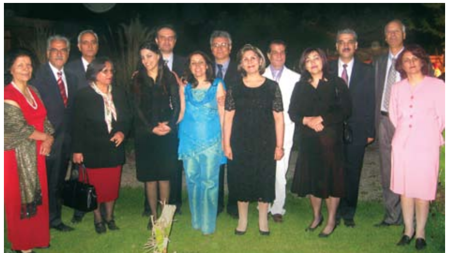
An undated photograph of the seven Bahá'í leaders currently held in Evin prison, taken before their imprisonment, with their spouses.

On 10 July, Amnesty International issued a press release calling on Iranian authorities to release the seven, saying it considered them to be “prisoners of conscience.”