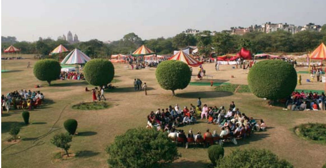
In New Delhi, India, some 2,800 people gathered in late November. At one point, they spread out in some 68 workshops on the grounds of the Bahá'í House of Worship.