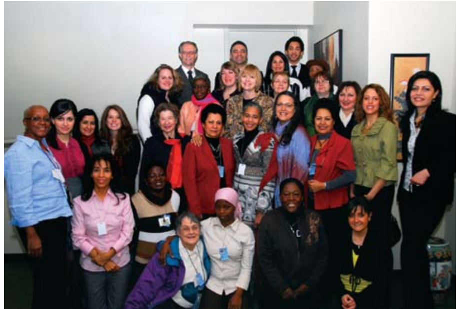
Thirty Bahá'ís from 18 countries participated in the 53rd annual UN Commission on the Status of Women.