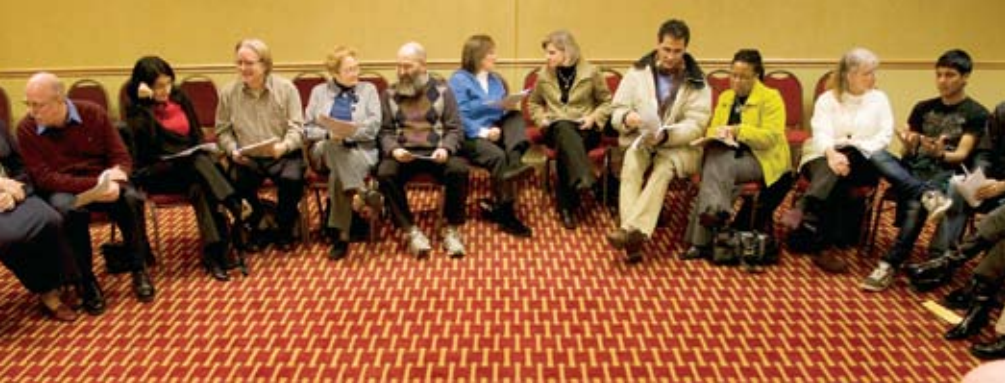
A small discussion group at the Stamford, USA, conference.

religious backgrounds also attended, whether family members, friends, or others who are interested in grassroots efforts at community building.