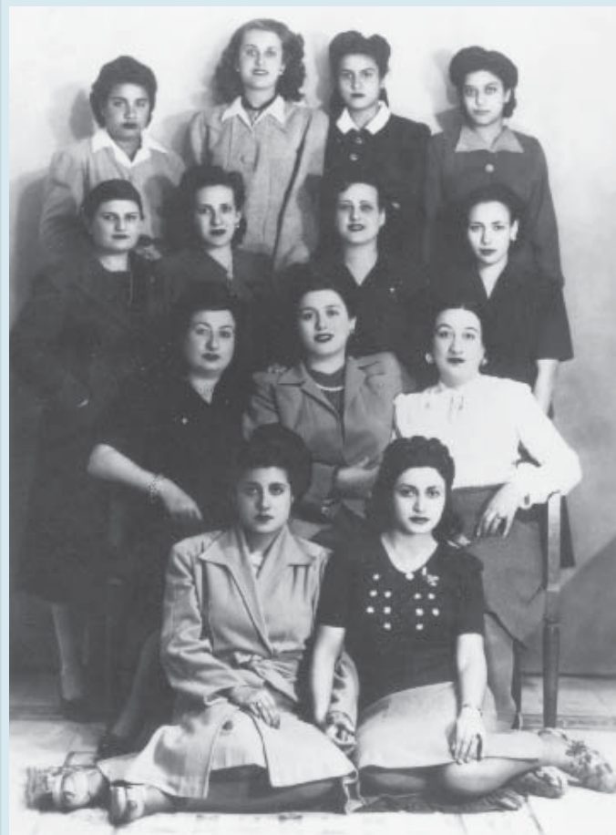
A group of Bahá'í women in Alexandria, Egypt, in 1947.

The government promised that individuals would remain free to practice their religion. In keeping with the Bahá'í principle of obedience to government, the Bahá'ís of Egypt duly disbanded their institutions immediately. The Faith's members shifted to a footing that emphasized quiet worship by individuals and families, with limited social and educational activities focused on internal development. Unfortunately, they have nevertheless faced episodes of harsh persecution, along with continuous restrictions on their personal, religious and social activities. ■