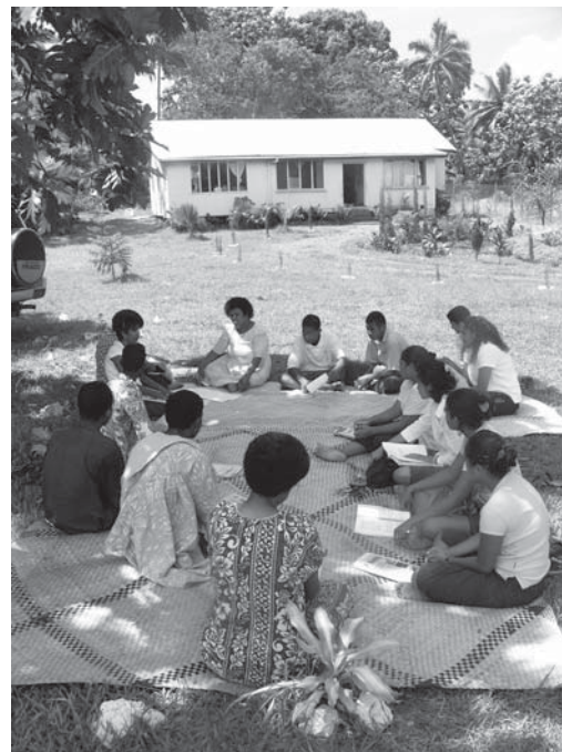
This photograph of a study circle at the Bahá'í center in Suva, Fiji is among those featured in The Bahá'í World 2004-2005.