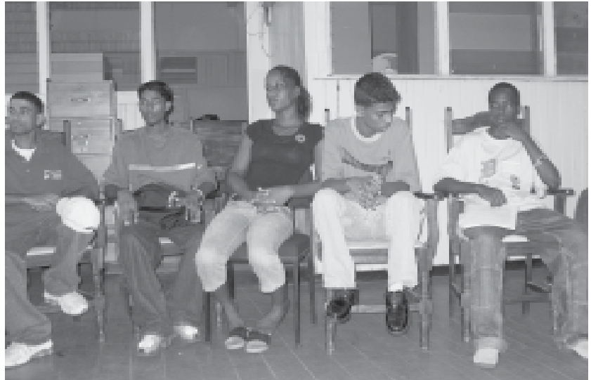
Members of the Future Club in Georgetown, at a Youth Can Move the World session on suicide prevention.