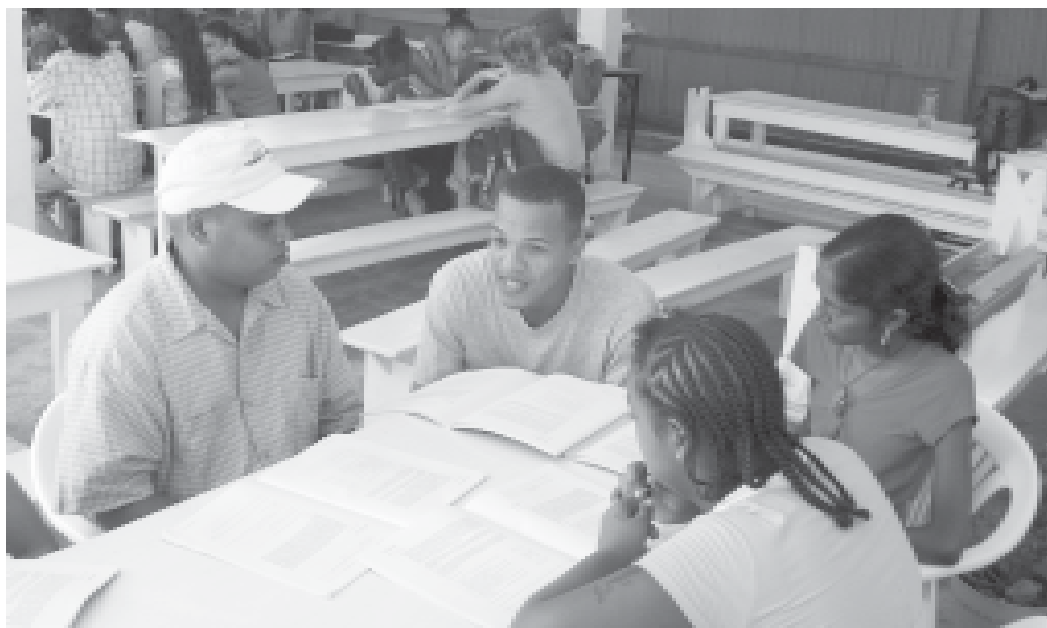
Young people from around Guyana at a Youth Can Move the World facilitators' training session.