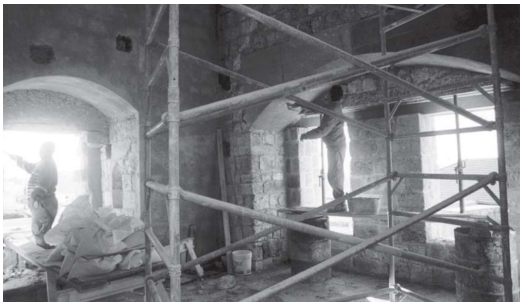
The restoration work in the room once occupied by Bahá'u'lláh. Many measures were taken to ensure the sacred and historic character of the citadel was respected.